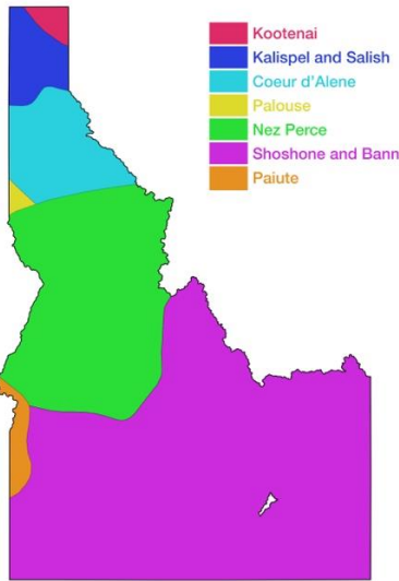
Idaho Tribes' approximate ranges before White contact.