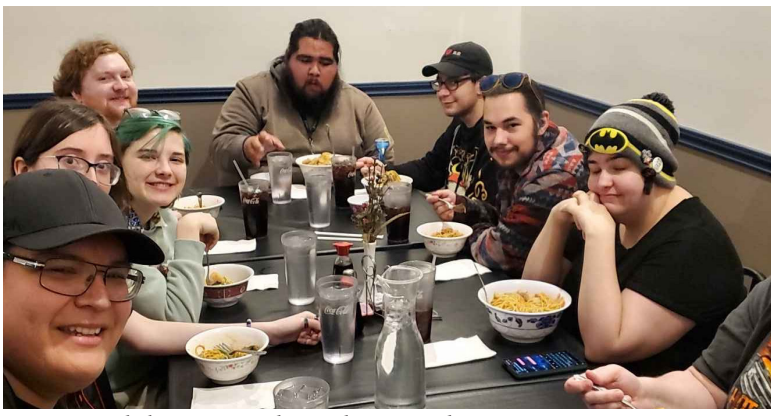
Gaming Club game night and trip to the Game-con in Moscow