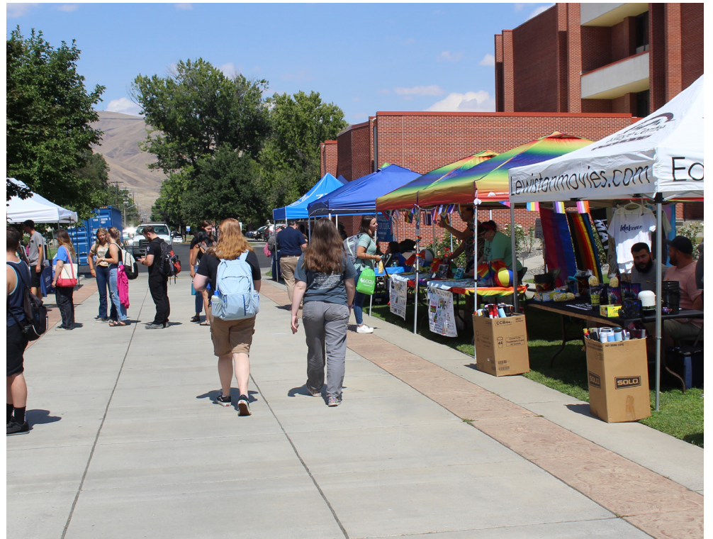
By Lizette Ohlund