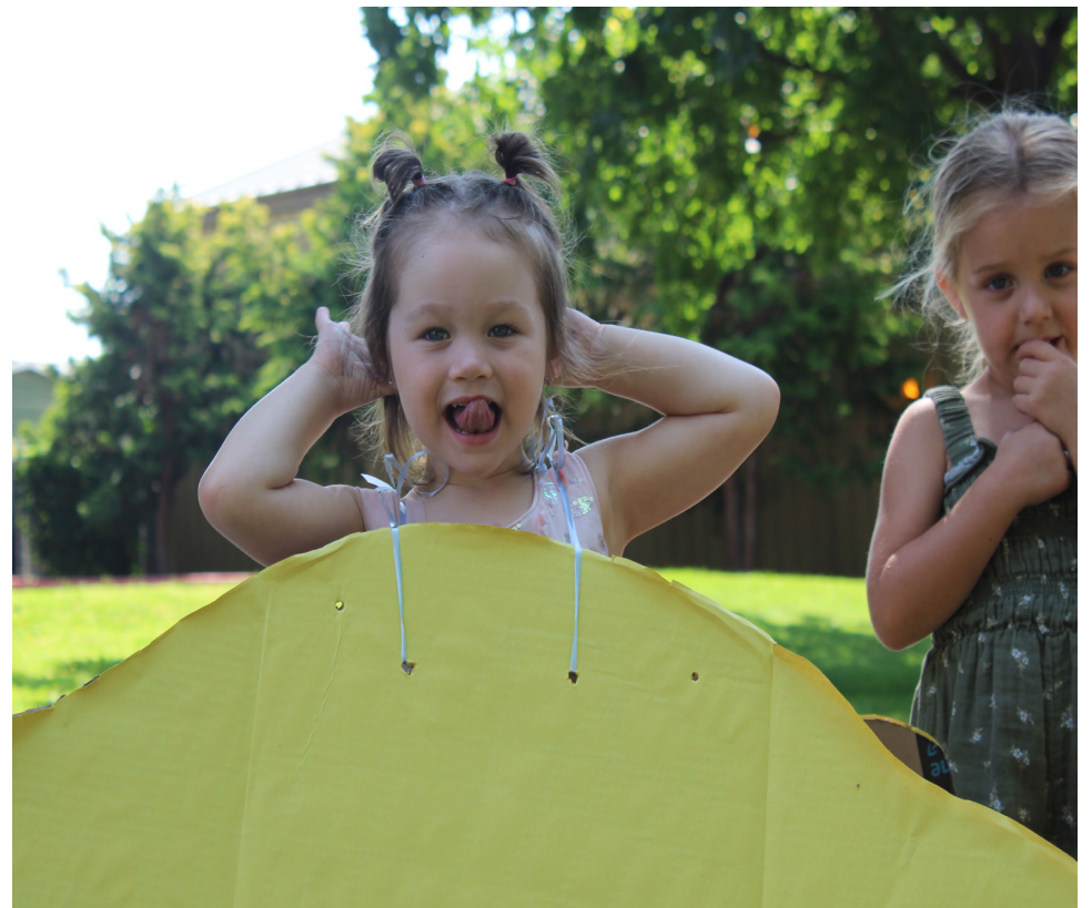
By Jadence Gingerich

Debit cards are only available to P1FCU members with an active checking account. Insured by NCUA.